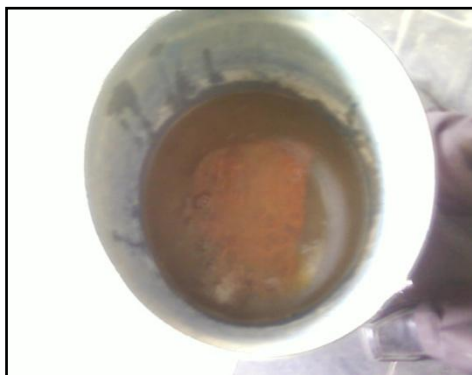
Fig: 5. Determination of water absorption