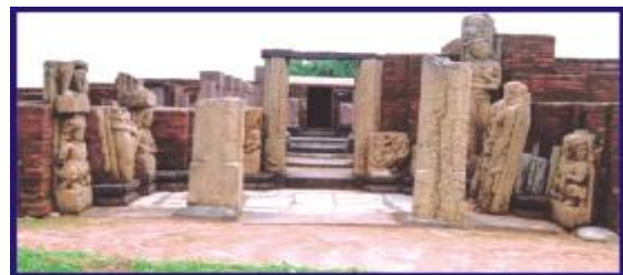
Fig: 1. Anand Prabh Kuti Vihara