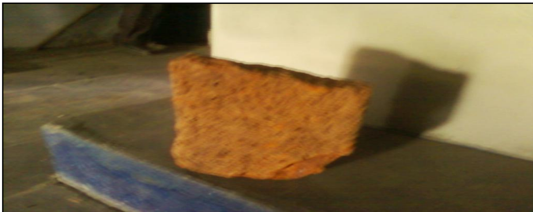
Fig: 6. Efflorescence