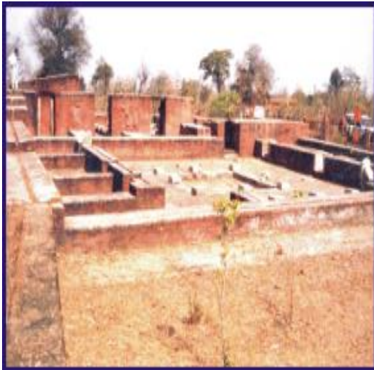
Fig: 2. Swastika Vihara

This monument is contemporary to Anand Prabhu Kuti Vihar at Sirpur situated at the distance of only 400 meters from the said monument. It is said that being in the shape of Swastika (a holy symbol) it was named as Swastika Vihar. A big sculpture of Lord Buddha is kept here in its sanctum. This beautiful Vihar was built just after the Anad Prbh Kuti Vihar in 7 th -8 th cent. A. D. This is a brick built Buddhist monastery smaller than Anand Prabhu-Kuti.