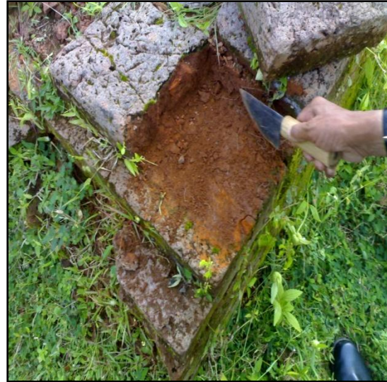
Fig: 3. Collection of Mortar Sample

The Mortar Used In The Brickwork Of Ancient Structure Is A Clay-Slurry Type.