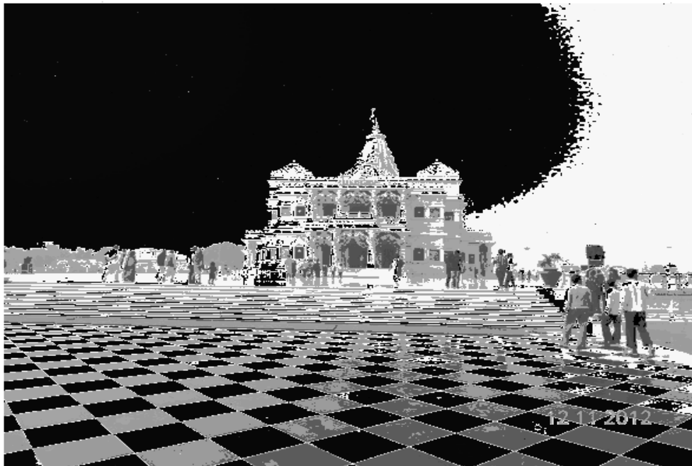
Fig: 2. output image